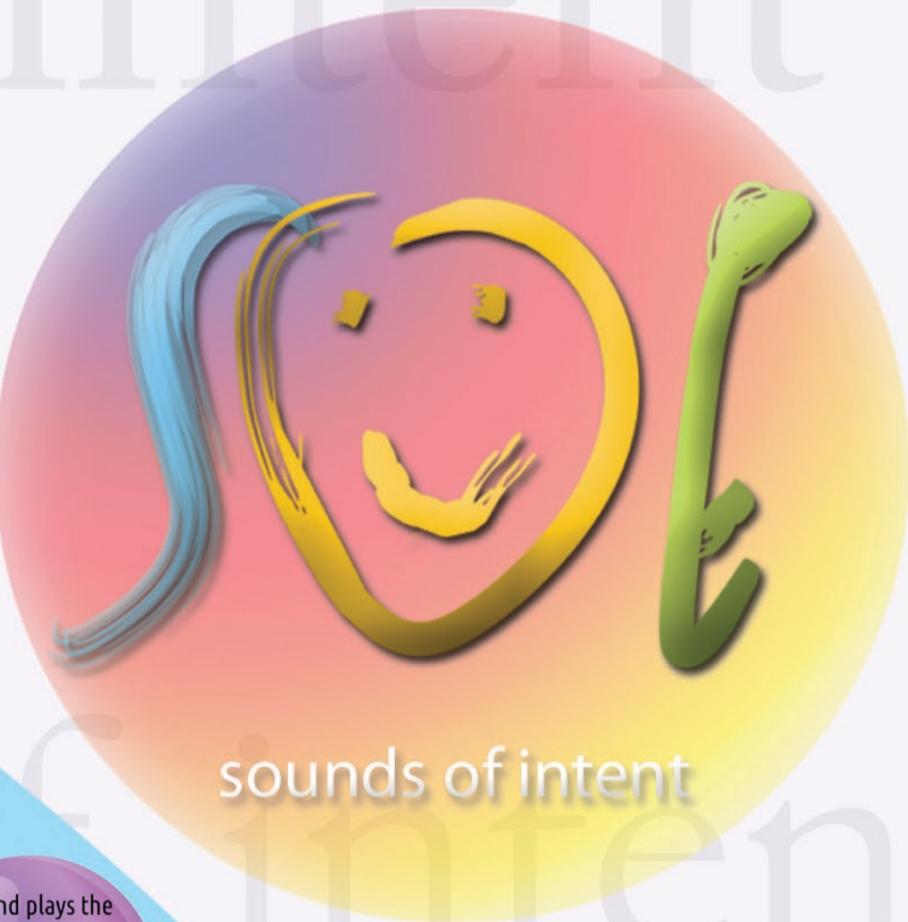
sounds of intent

However, the most rapid period of development is in the early years, when learning seems to be effortless. Adults need to work hard, though, to give children the best possible musical start.